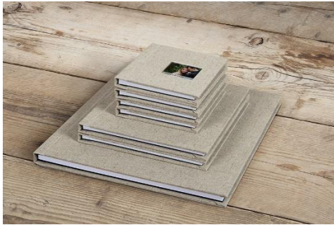
Hessian album covers